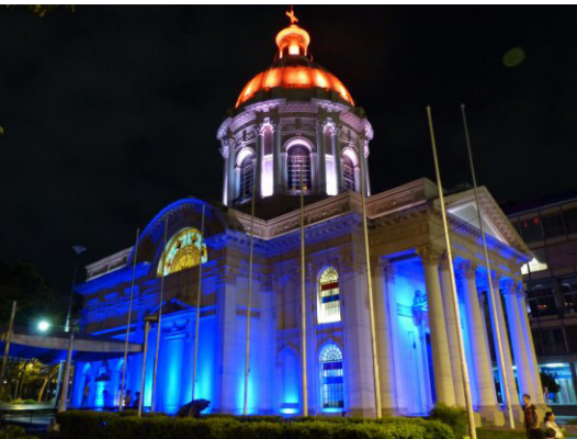
Pantheon of the Heroes

Asunción, capital of Paraguay and known as the Green Capital of Ibero-America due to its rich and abundant greenery, is a dynamic and growing city that combines nature, historical colonial-style architecture and infrastructure. Being at the heart of South America, the city offers easy access from every part of the world and has already been host to many other important international events. Comfortable accommodation in national and international hotel chains is available, as well as many modern conference facilities.