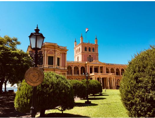
López Palace. Government house